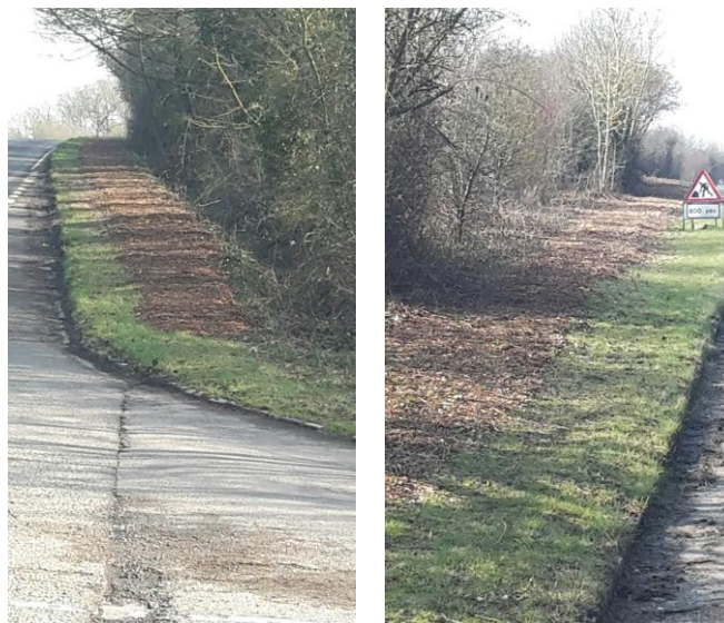
The Green Path on Heath End Road

Little Marlow Parish Council worked in conjunction with Chepping Wycombe Parish to create a Green Path which connected both of our parishes. We were very pleased to be awarded funding from Bucks County Council's Chepping Wycombe's Local Area Forum. The work was completed in January and we are very pleased with the result. It is proving popular with residents already.