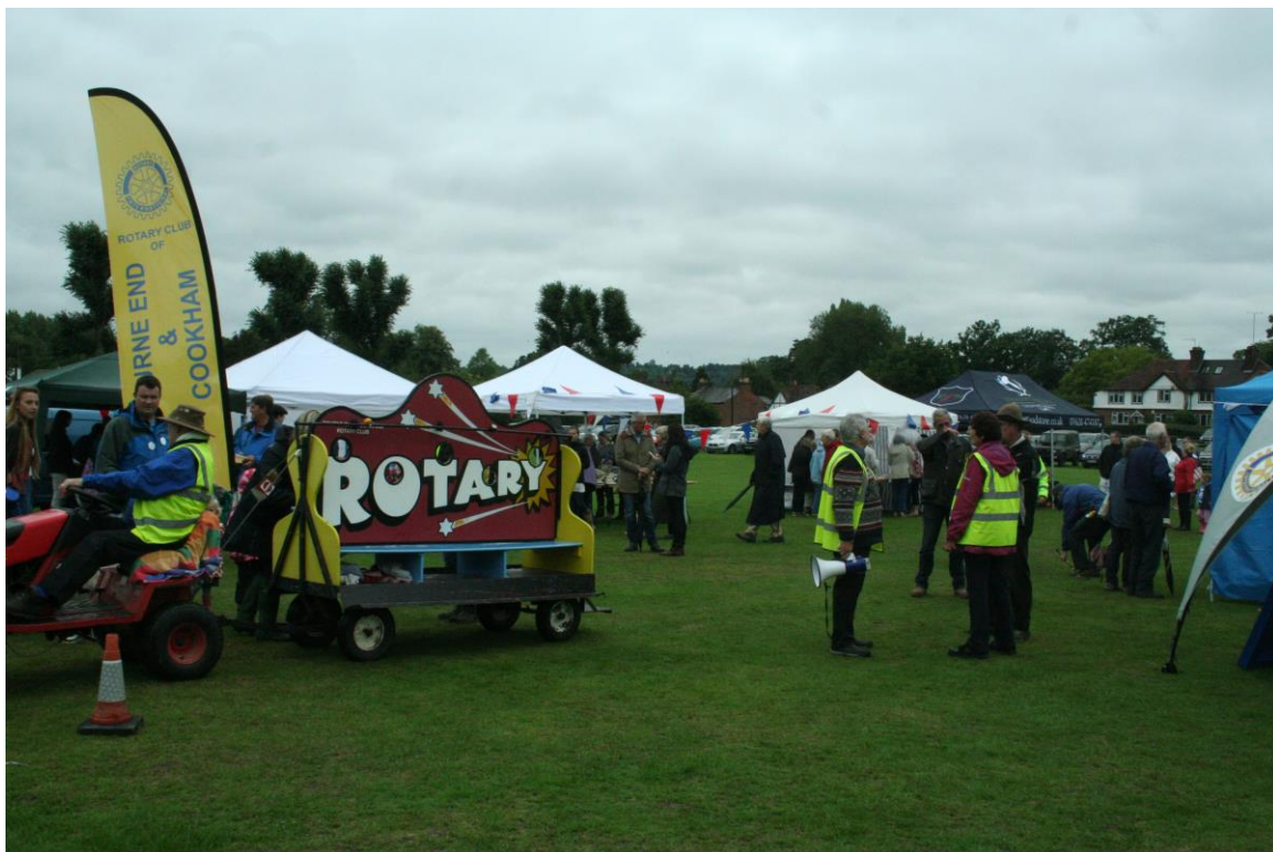
Little Marlow Village Fete 2015 - before the sun came out!

Chairman, Little Marlow Village Amenities Committee