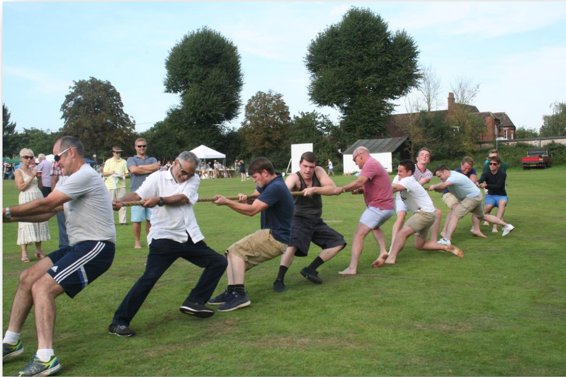
Taking the strain at the Tug of War at the 2017 Fete