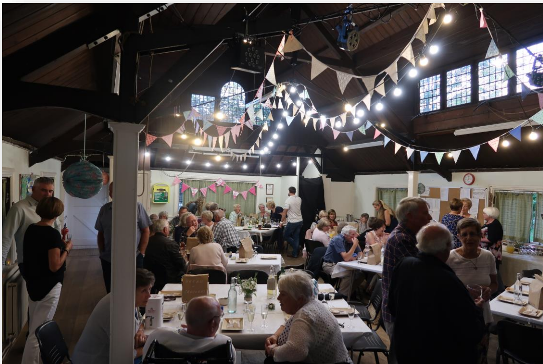
Abbotsbrook Hall – inside

The hall is still available to hire for children's parties etc on Saturdays and even with the work being undertaken, you can still enjoy Abbotsbrook Hall's unique 'arts and crafts' architecture.