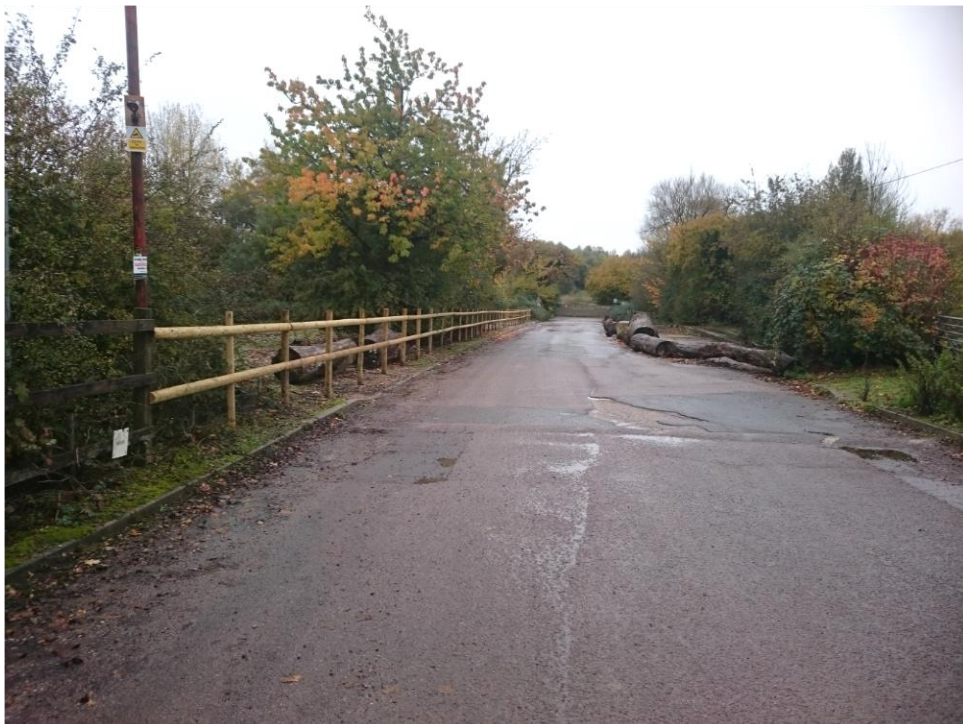
Muschallick Road after fly-tipping waste removed