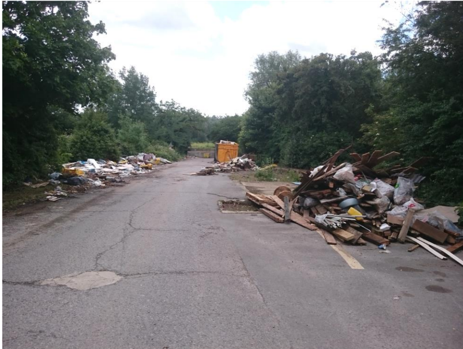
Fly-tipping on Muschallick Road