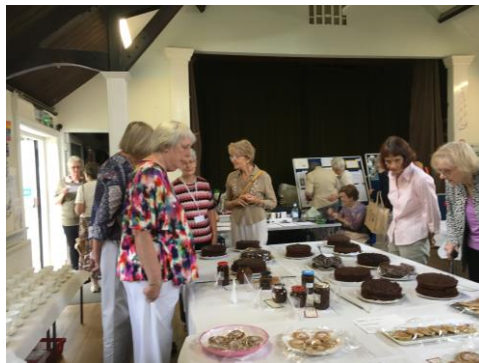
Members of Little Marlow & Well End WI deciding which is the best chocolate cake out of 13 entries in their Summer Show".