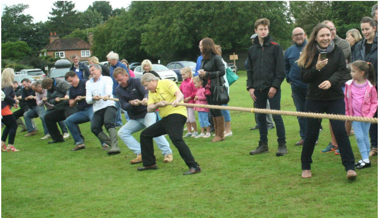
Kings Head Team