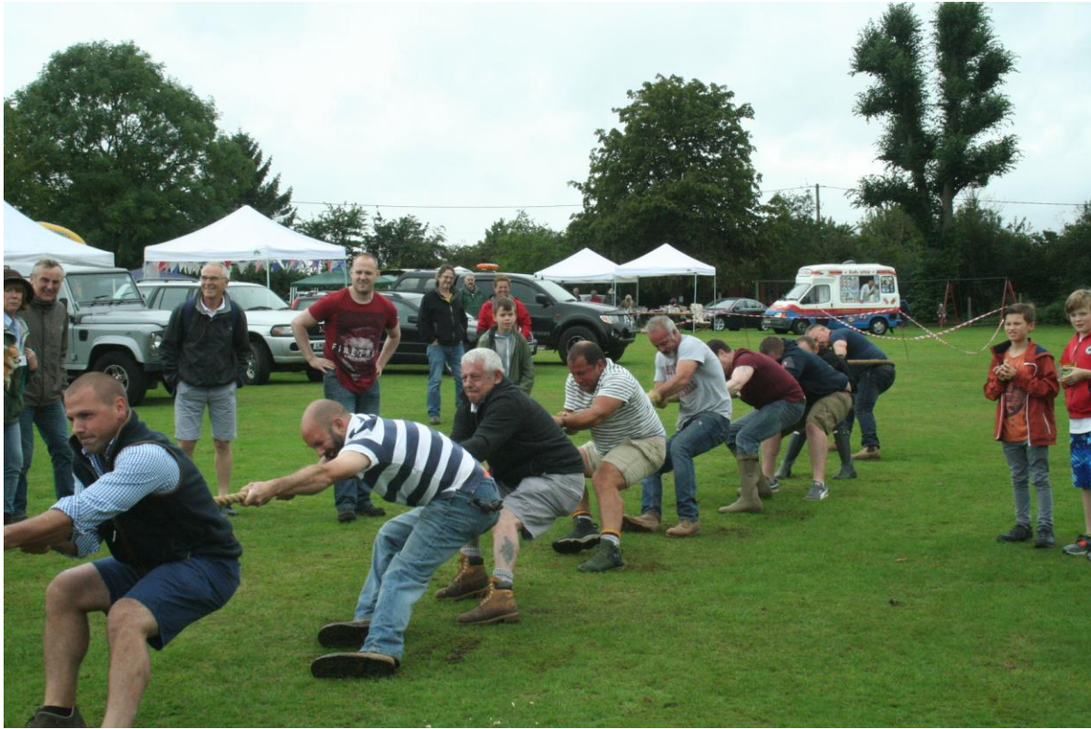
Queens Head Team