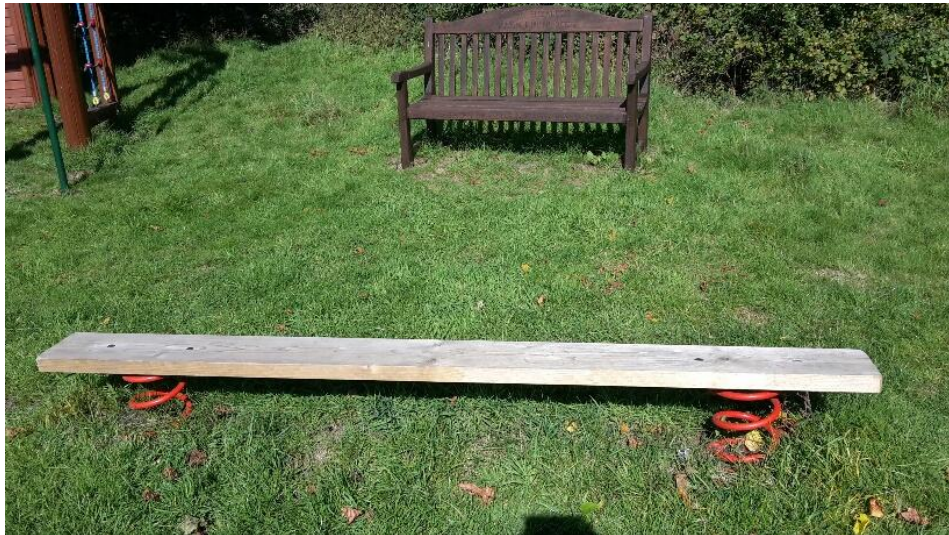
New Wobble Board