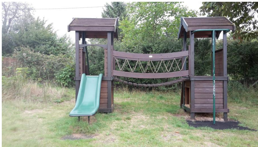
Re-painted Multiplay Unit and repairs to the platforms and ladder