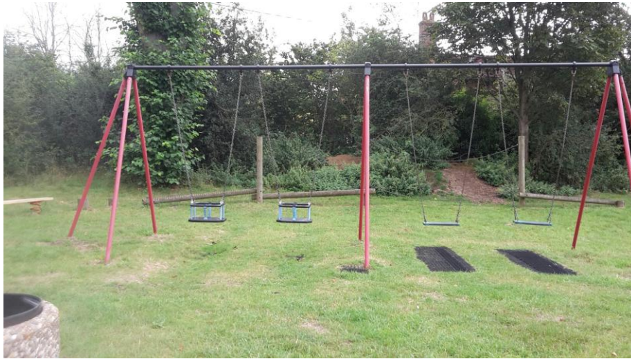
Repainted Swings and better matting underneath

A lot of investment and maintenance has been undertaken in the playground over the last few months. The swings and the multiplay unit have had a spruce up and two new Springers and a Wobble Board has been added. This represents over £2000 of expenditure. We hope our younger parishioners enjoy the improvements. We have even bigger plans for 2016 /17.