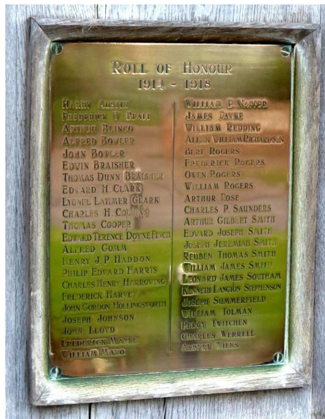
The Role of Honour