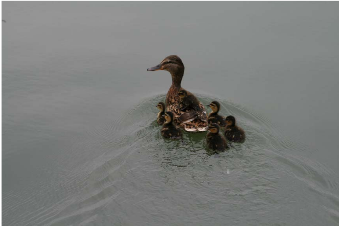
Ducklings, Spade Oak Lake